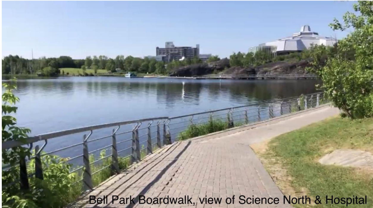
Bell Park Boardwalk, view of Science North & Hospital

The city and suburban communities were combined to become the Regional Municipality of Sudbury in 1973. In 2001, the following communities were merged to form the city of Greater Sudbury: Valley East, Rayside-Balfour, Nickel Center, Copper Cliff, Walden, Lively, Onaping Falls, and Capreol.