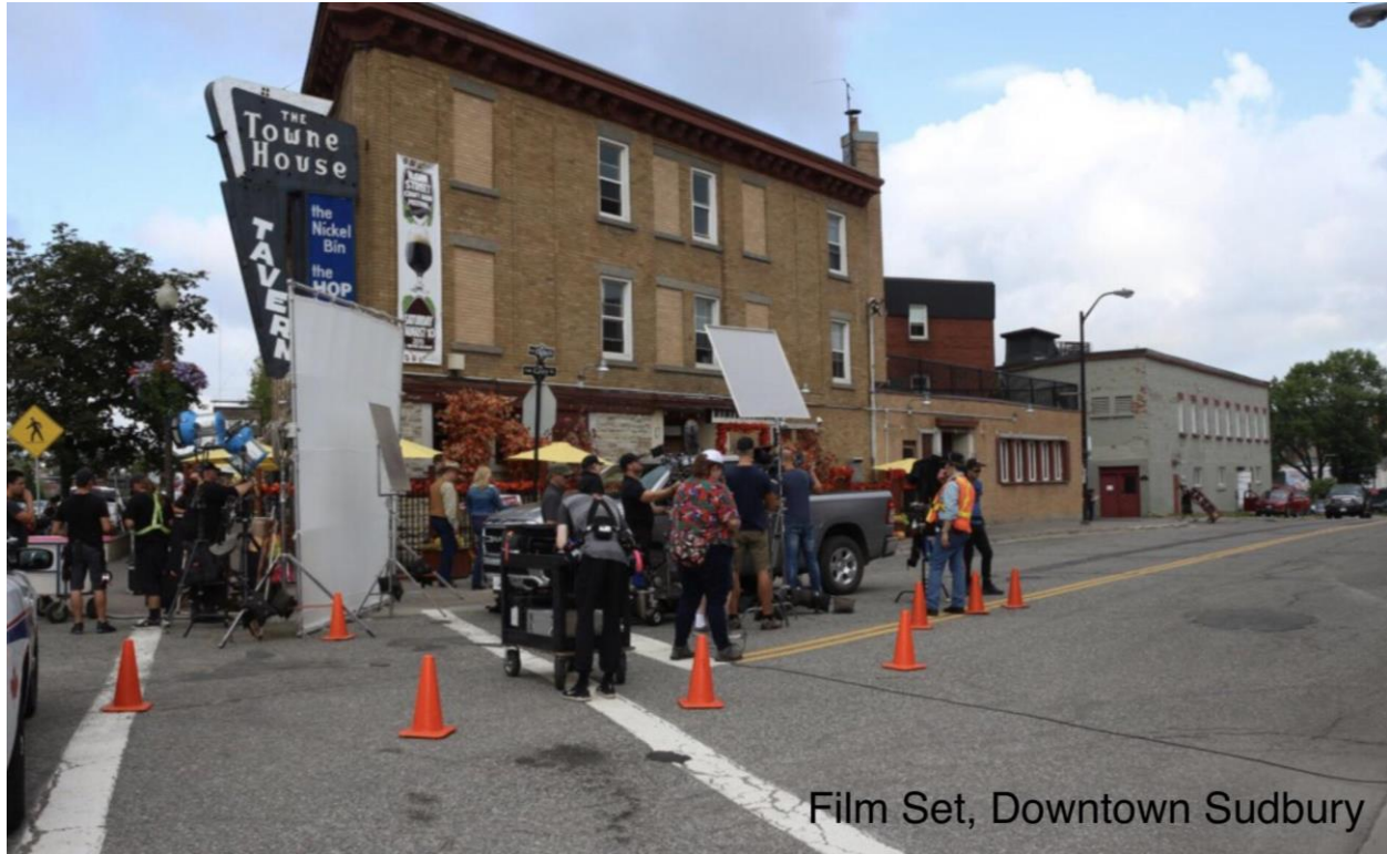
Film Set, Downtown Sudbury