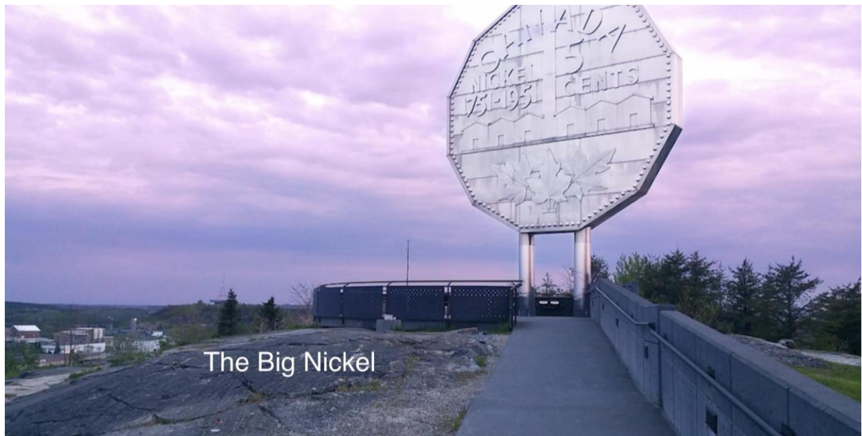
The Big Nickel